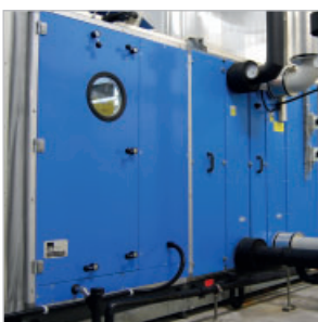
7Air revision front mounted on humidifier section

Object: Cityport, Zurich Planner: Willi Werner Engineering GmbH, Zurich Installer: ENIP AG, Glattbrugg