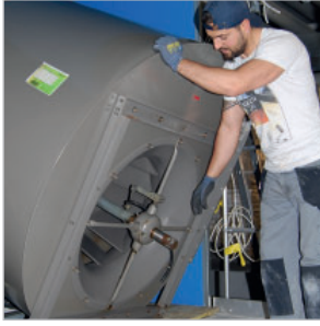
Old housing fan is removed and ...