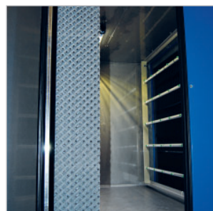
Installation of new efficient hybrid humidifier